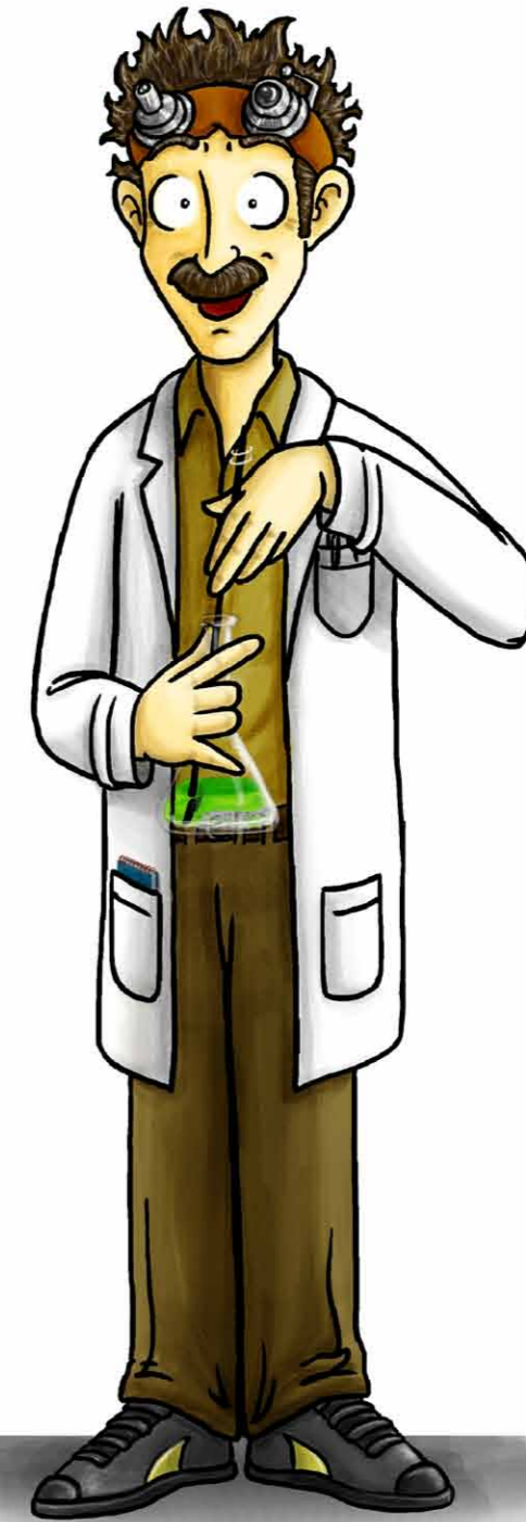
His father is an inventor.